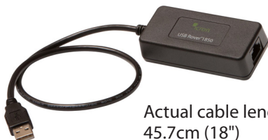
LEX (Local Extender)

The USB 1.1 Rover 1850 extends USB 1.1 connections beyond the desktop up to 85* meters.