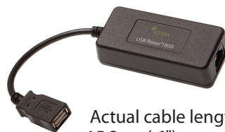
REX (Remote Extender)